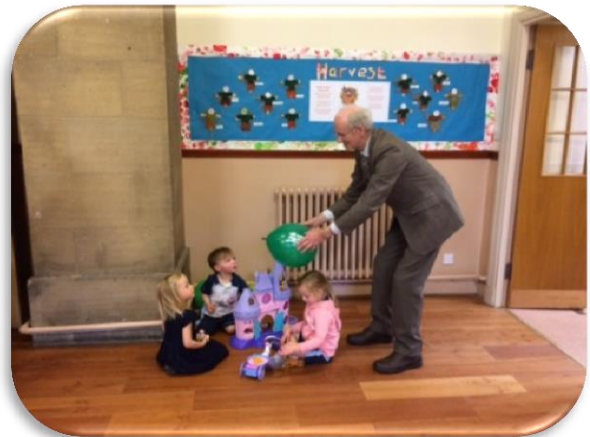
Fun being had by all ages!